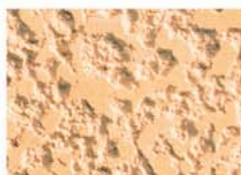
Golden Sand FD160C