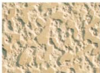
Colorado Gold FD135C