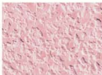
Rose Pink FD155C