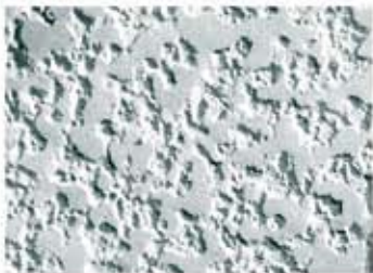
Lite Dove Grey FD125C