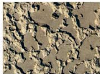
Burly Wood FD170C