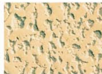
Sun Yellow FD150C

*Darker Shades produce warmer temperatures. Printed colors may vary from actual cement products.