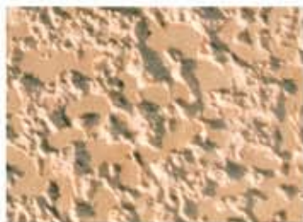
Dark Sand Buff* FD115C