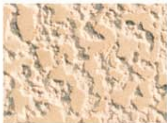
Regular Sand Buff FD110C