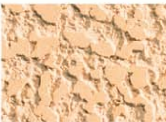
Coral Peach FD140C