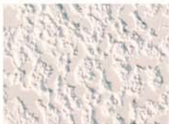
Lite Sand Buff FD105C