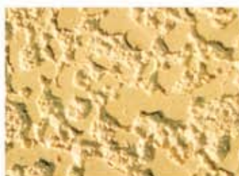
Aztec Gold FD130C