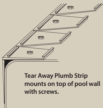
Tear Away Plumb Strip mounts on top of pool wall with screws.